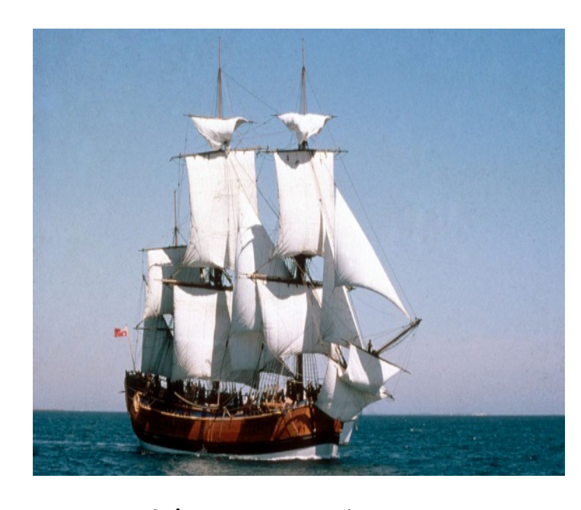
The James Craig

I am very proud of the students for their sensible behaviour. It was a great day out!